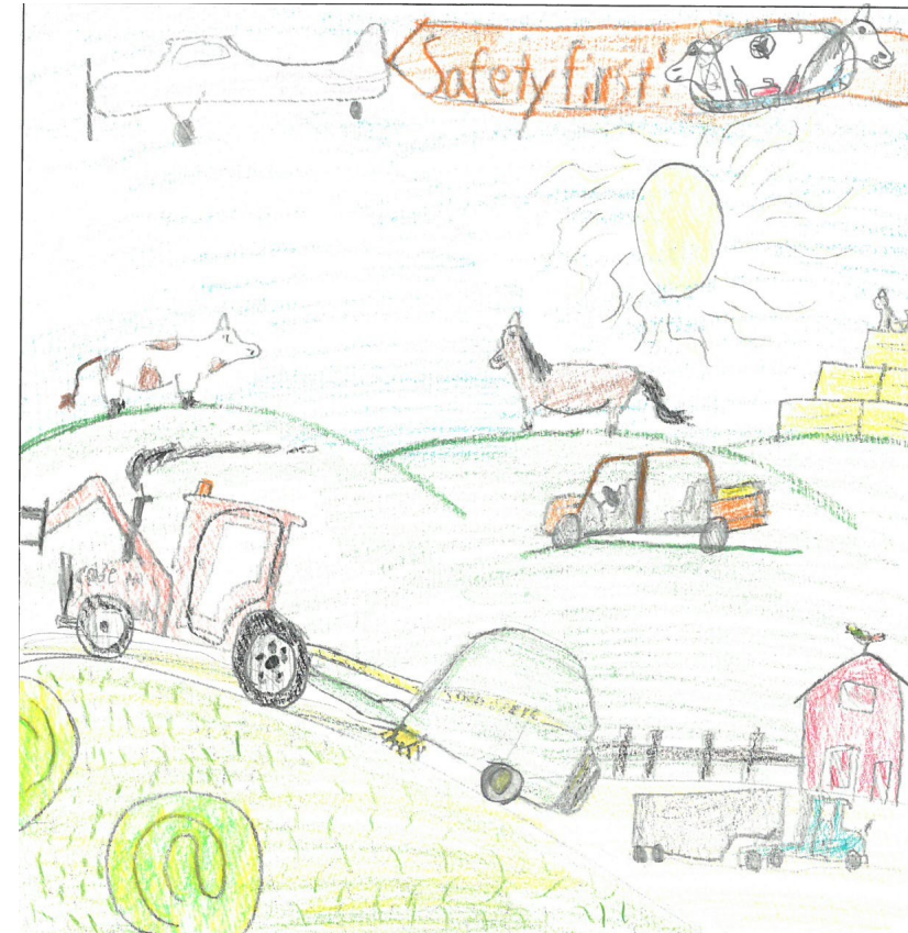
Cover art by Barrett Walker, Falun Elementary

Entries accepted on Friday September 2 2pm - 6pm